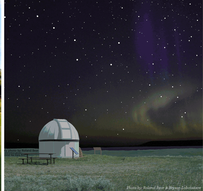
ky photo by Roland Bear Photo by: Roland Bear Photo by: Lorne Scott