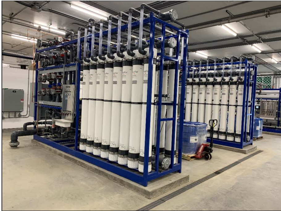
Ultrafiltration systems now operational.