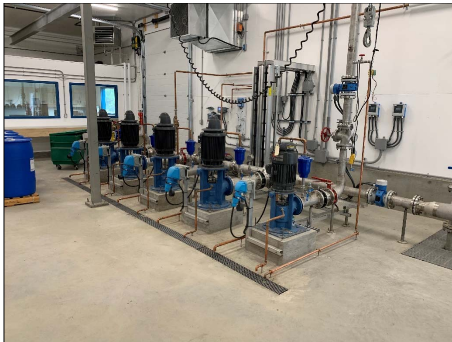
Distribution pumps are providing water to the town.