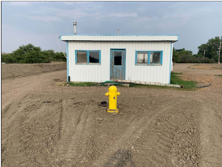
Flushing hydrant (Change Order #7) installed near old WTP.