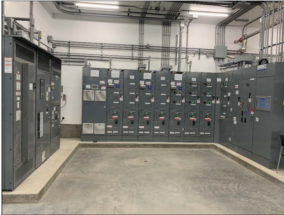
Electrical equipment area completed.