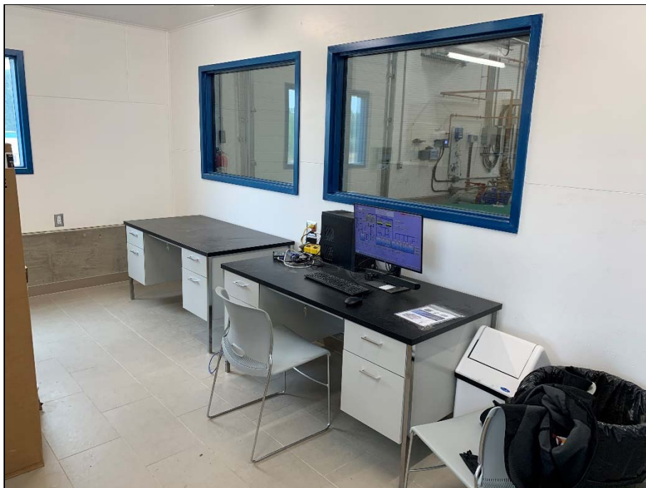
Office partially set up; remaining furniture and equipment to be unboxed prior to commissioning.