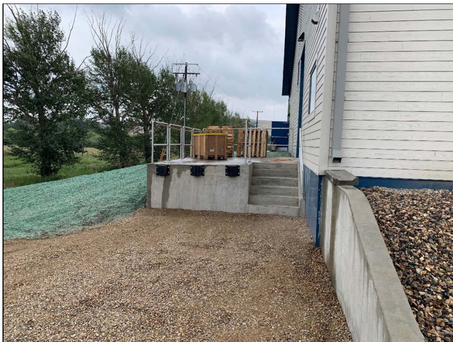
Loading dock grading completed; hydroseeding on backfill at left.