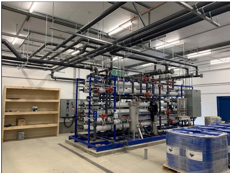
Nanofiltration systems now operational.