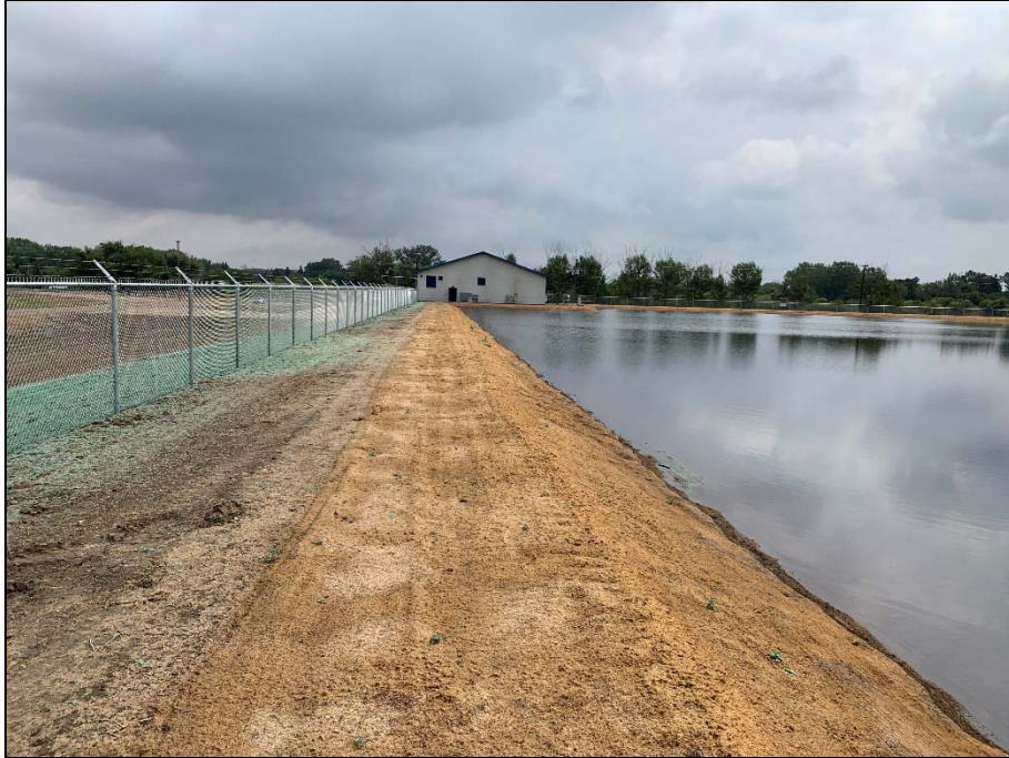
Berms, hydroseeding and fencing completed around reservoir.