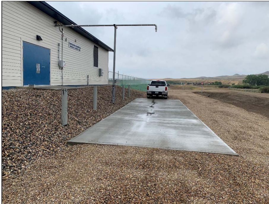
Truck fill slab and roadway completed.